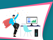
Chart Master The ultimate Technical Analysis Program

MasterTrader Pro The Ultimate Stock Market Mastery Course